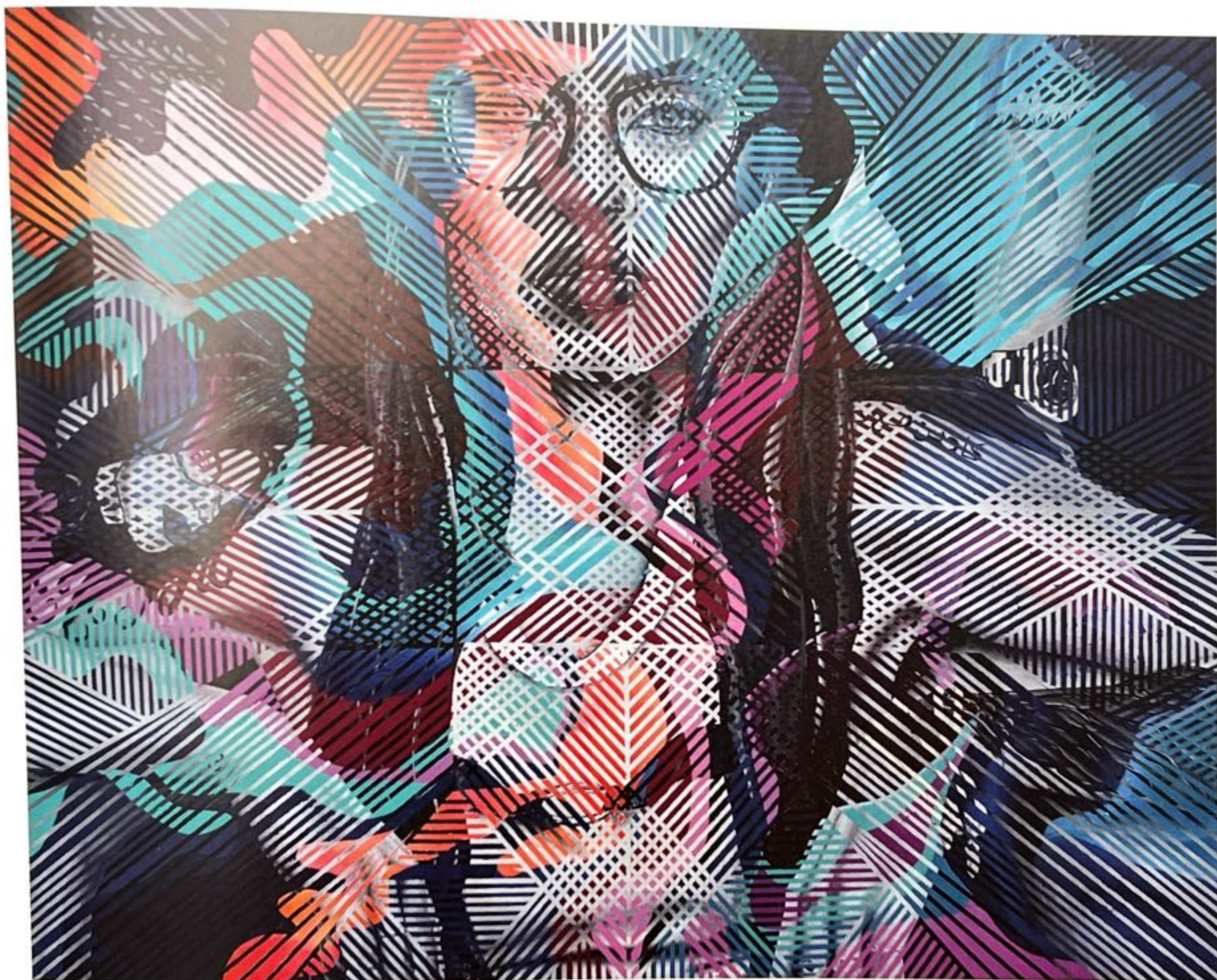
Gute Mädchen kommen in den Himmel